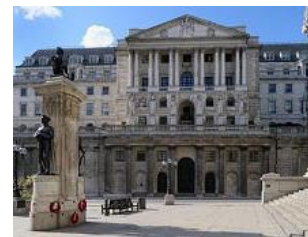
The Bank is confident

throughout the first half of 2010 - although England crashing out of the World Cup may cool things down a little. Business investment continues to recover, but with a focus on cost cutting and increased efficiency. Unfortunately, it appears that exporters have not taken advantage of a weaker pound to cut overseas prices and thereby increase market share, thus apparently boosting short term margins at the cost of long term potential.