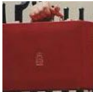
The first Budget for a coalition for many years

Overall, this was well received despite hikes in tax on capital gains and VAT. The former will largely affect higher earners, whereas the latter will affect us all and is probably a regressive tax in that it hits the less well off progressively more than the wealthy. On the other hand, the increase is only 2.5%, so it should not have an inordinately large impact on spending overall. In fact, we may see a mini boom towards the end of this year as people try to get their discretionary spending in ahead of the increase. At least children's clothes and food are not affected; they could so easily have lost their exempt status.