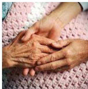
Those in greatest need must be provided for

Welfare spending appears to be one of the largest of the targets that George Osborne has hit - alongside many other forms of government spending. But the fact is that we have to cut our spending if we are to survive and everyone has to share the pain. Unfortunately, there are too many people who have, over the past thirteen years, been encouraged to consider that the state will look after them whatever. In reality, the welfare state was established to provide security for those who