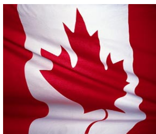
World leaders' meeting

In what appears to have been a more or less positive meeting, world leaders have agreed to halve their deficits within the next three years. However, as the International Monetary Fund points out, it is not quite as simple as that; the stronger economies must support the weaker ones. After all, the entire world cannot survive on exporting to other countries; someone has to be the net importer.