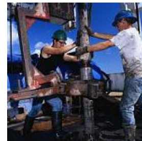
Wisdom for future Budgets

Since the Gulf oil spill started, BP shares have fallen by more than 50%. It should be remembered, however, that this is a massive company with immense reserves and it has probably only suspended its dividend under political pressure from the US. Despite adverse publicity after its CEO was seen sailing on the Solent a week or so ago, it seems that Barak Obama has agreed with his new best friend, David Cameron, that neither the US nor UK would benefit from a weakened BP.