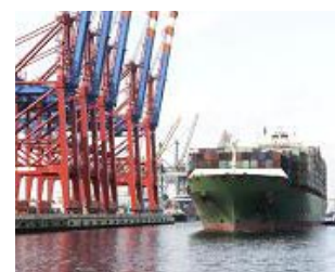
Exports could prove a major driver of the recovery

On the negative side, the Institute of Directors' respected Chief Economist, Graeme Leach, suggests that GDP growth will be just 1.2% in 2011, producing the "square root" shaped recovery that some people predicted. If this is the case, then more spending cuts may be required than those included in the recent spending review. Others, however, such as Kevin Daly of Goldman Sachs take a more positive view, suggesting that our recovery is faster than following the past five significant financial crises (Spain in 1977, Norway in 1987 and Japan, Sweden and Finland in 1990).