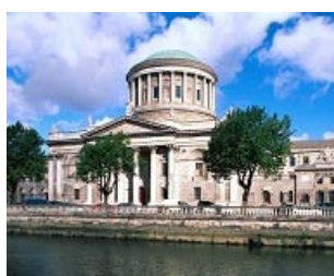
The tiger economy is under threat

Total cuts of €10 billion, including €2.8 billion for welfare and a 25,000 cut in public sector jobs, will be accompanied by a VAT increase from 21% to 23% by 2014 and €5 billion in new taxes. This is in addition to the €14.6 billion savings made since 2008. There will not, to the disappointment of France and Germany, be any hike in corporation tax from 12.5%.